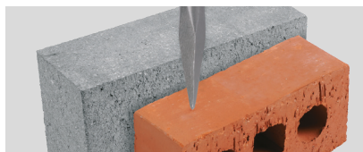
POINTED CHISEL KRT011020