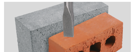
FLAT CHISEL KRT011021

Our +50 years of experience guarantee a professional and high quality service.